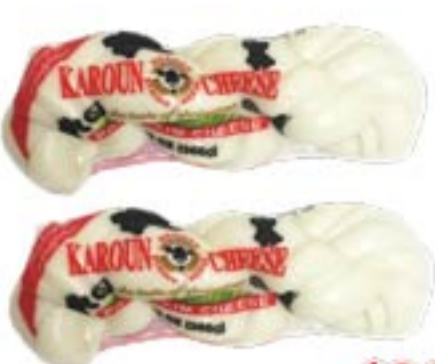
Karoun String Cheese Partskim 13OZ 4.99 lb