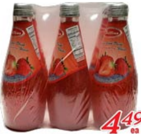
Bettino Basil Seed Drink Strawberry 6PK 4.49 ea