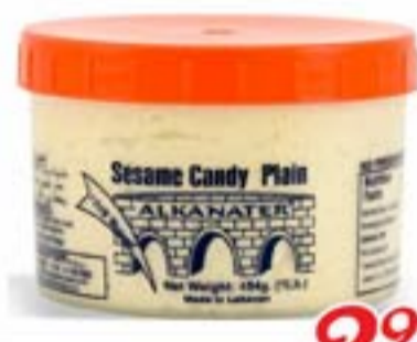
Kanater Halawa Plain 1LB 2.99 ea