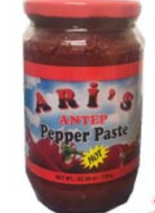
Aris Pepper Paste Hot 720GR 3.69 ea