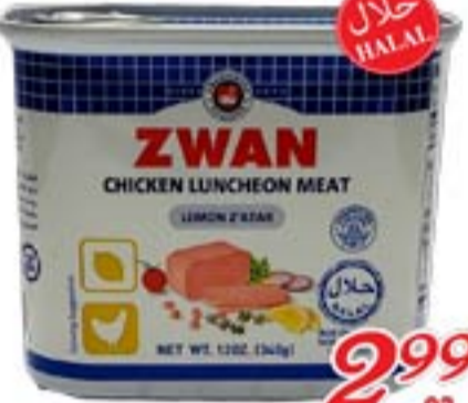
Zwan Chicken Luncheon W/ Lemon 12OZ 2.99 ea