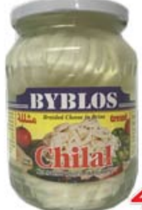
Byblos Chilal Cheese Byblos 400GM 4.99 ea