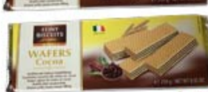
Feiny Biscuit Wafers with Cocoa 250GR 1.49 ea