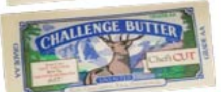
Challenge Butter Unsalted 1LB 3.99 ea