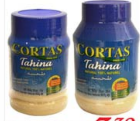
Cortas Tahini 1LB 3.39 ea