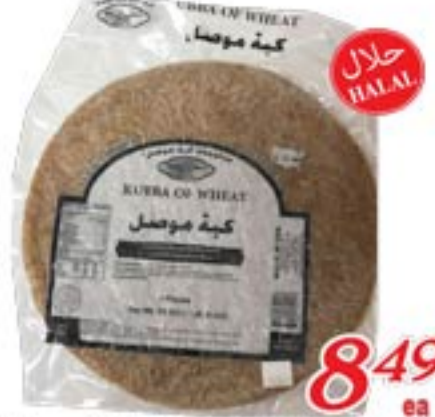
Mosul Kubba Whole Wheat with Beef 25OZ 8.49 ea