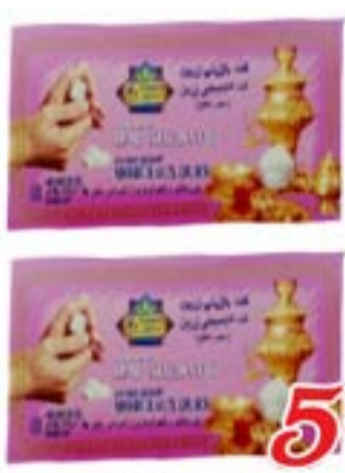
Sugar Cubes Zarrin 35OZ 5.99 ea