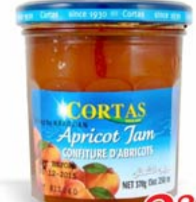
Cortas Apricot Jam 13OZ 2.29 ea