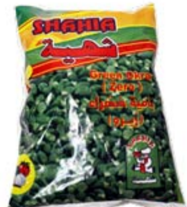
Shahia Okra Zero 14OZ 3.39 ea