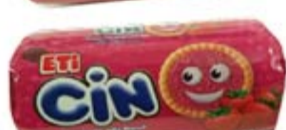
Strawberry Jelli Biscuit Cin ETI 351gm 1.88 ea