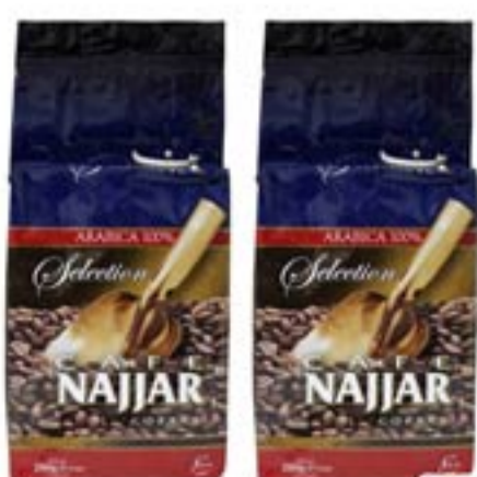
Najjar Coffee Plain 200GR 3.39 ea