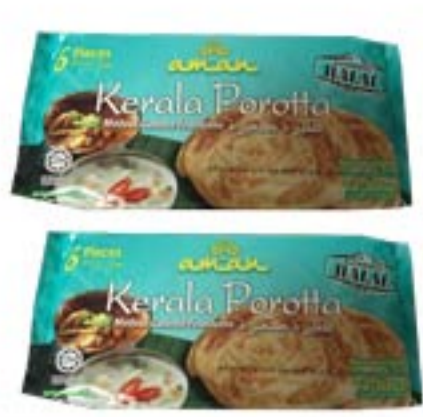
Aman Kerala Porotta 12.7OZ 1.59 ea