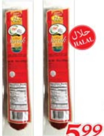
Nema Soujuk Stick Hot 100Z 5.99 ea