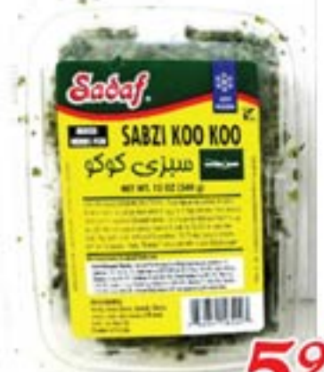
Sadaf Sabzi Kookoo 12OZ 5.99 ea