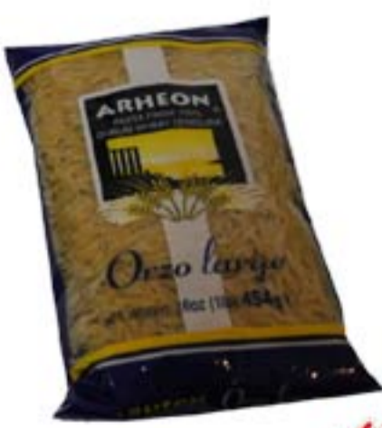
Arheon Orzo Pasta 16OZ 1.86 ea