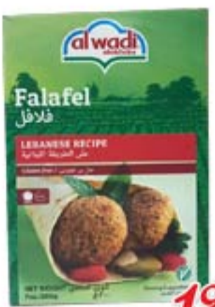
Alwadi Falafel Mix 7OZ 1.95 ea