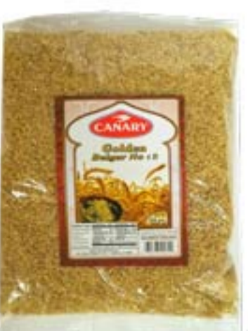
Bulgur Yellow #3 Canary 24OZ 1.89 ea