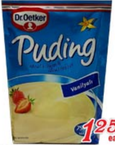
Dr.Oetker Pudding Vanilla 125GM 1.25 ea