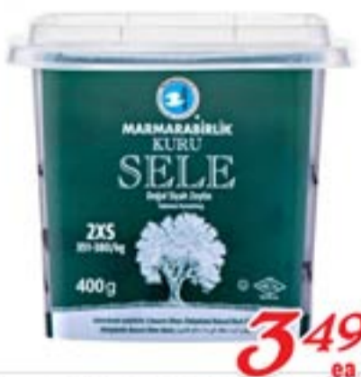
Kuru Sele Black Olives MBB 400g 3.49 ea