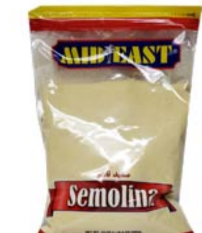
MidEast Semolina Flour 24OZ 1.59 ea