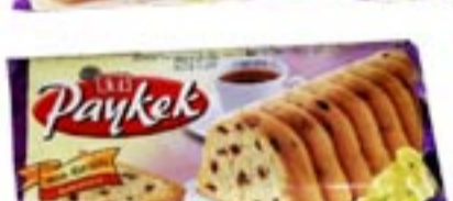
Eti Paykek Raisin 180GM 1.35 ea