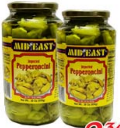
MidEast Imported Peppercini Pickled 32OZ 2.36 ea