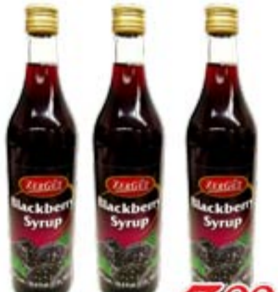
Zergut Syrup Blackberry 1LT 3.99 ea